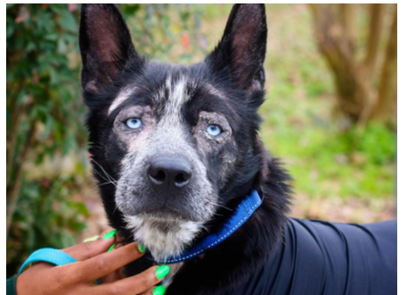
Being in foster gave Fenris the chance to regain his confidence and his health