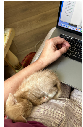
Homer, adopted and home