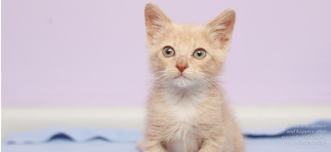
Homer, healthier and happier after several weeks in his foster home