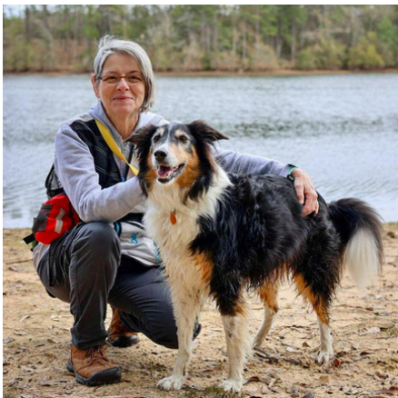
JUNE, ADOPTED SINCE 2013

Thank you for considering a donation to our BUILDING THE FUTURE campaign. Your contribution will make a lasting difference in the lives of countless animals and help us build a brighter future for them.