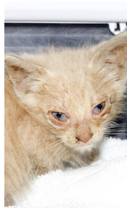
Homer's first day at the shelter