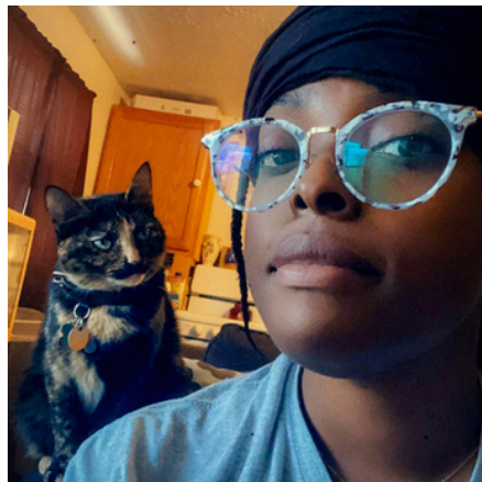
GLENDIA, ADOPTED SINCE 2018