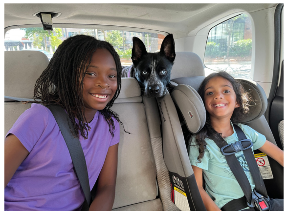
Fenris out and about town with his adoptive family